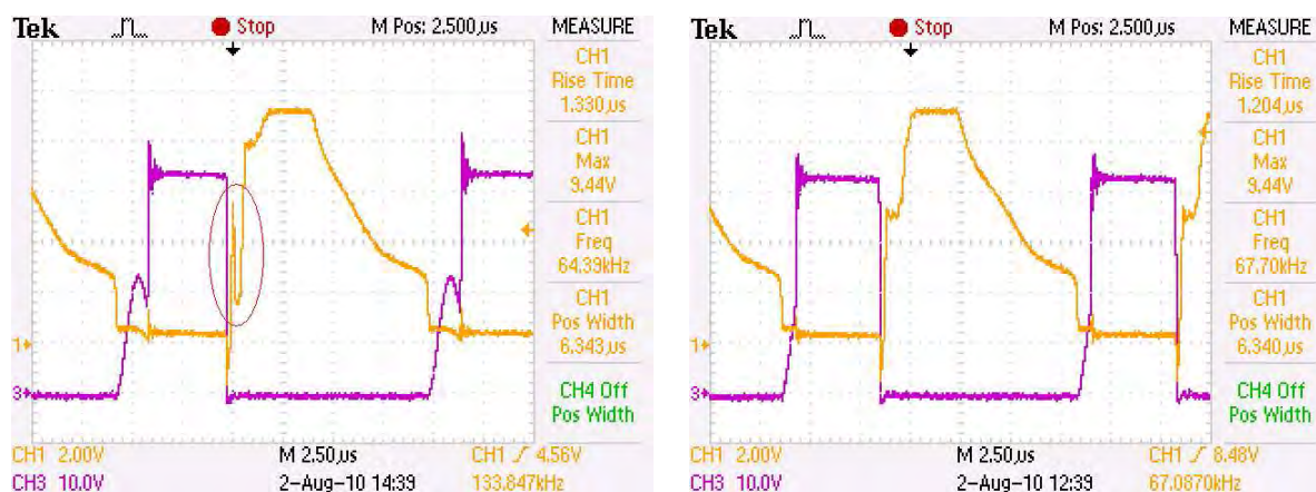
Figure 3. Secondary side driver operating waveforms: a) Gate voltage oscillation due to circuit inductance and b) Gate voltage with improved layout (Orange: Gate voltage; Purple: Drain voltage).

Improved layout can be achieved by 1) placing the control IC closer to Q2 and 2) increasing the PC board track width that connects the Drain input of ZXGD3103 with Q2. This resolves the issue as shown in Figure 3b. Finally, it is noteworthy that Q2 is turned off precisely when the Flyback current goes to zero, with little or no reverse current.