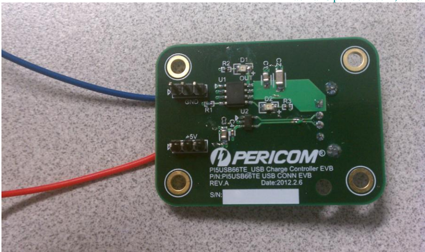
Figure 1: PI5USB66EVB

Figure 1 above illustrates the PI5USB66EVB (evaluation board). Follow the steps below to power your EVB and start charging as shown in Figure 2 below: