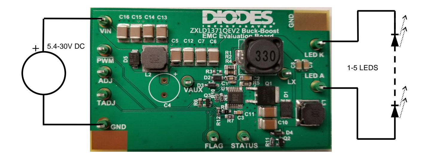
Figure 1: ZXLD1371QEV2 evaluation board and connection diagram

The ZXLD1371QEV2, Figure 1, is an evaluation board for the ZXLD1371QEV2 LED driver chip. The board is in a Buck-Boost configuration with an input voltage range of 5.4-30 VDC and will drive a string of up to 5 LEDs. It is set for an output current of 680mA and offers convenient connections for external control inputs and monitoring. The board also includes filter components for conducted EMC.