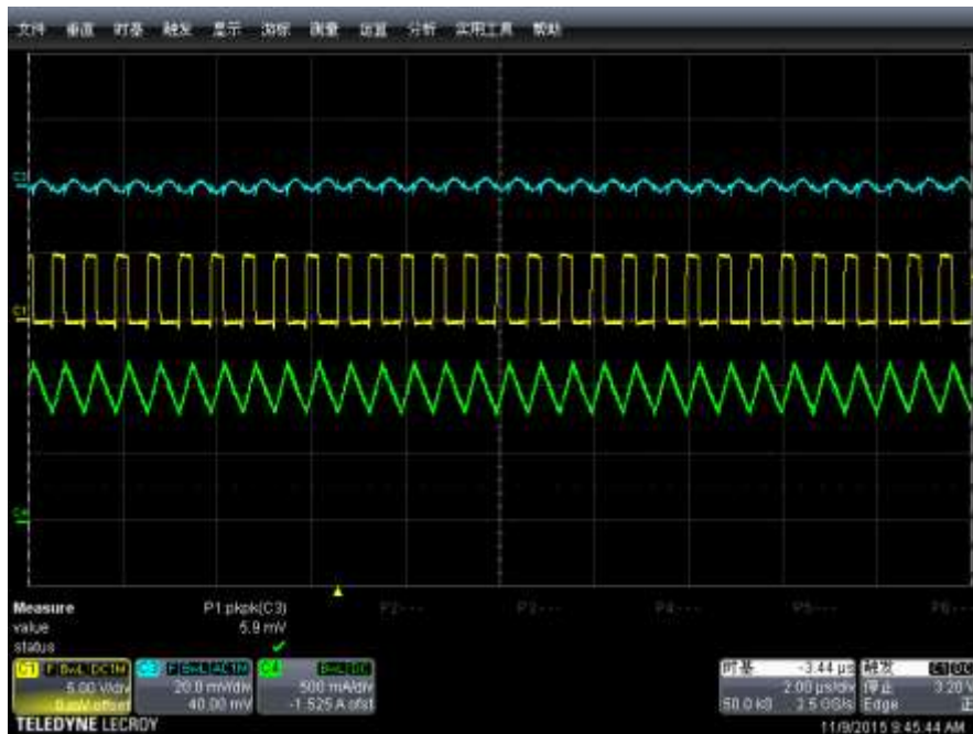
Operation waveform at Iout=1A (Blue-VoutAC; Yellow-Vsw; Green-IL)

This application note contains new product information. Diodes, Inc. reserves the right to modify the product specification without notice.