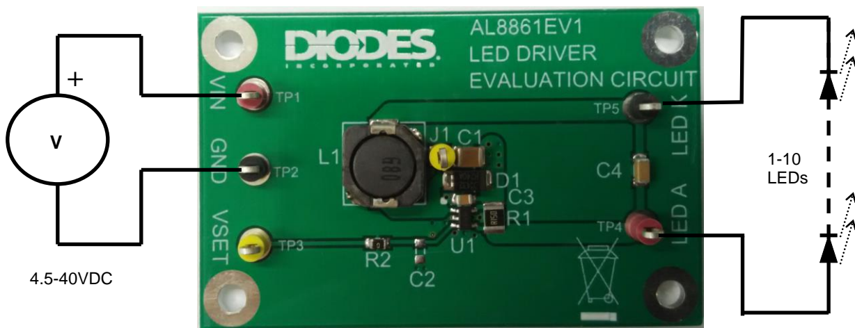
Figure 1: AL8861EV1 evaluation board and connection diagram

Warning: At 40V nominal operation with 680mA output, the LED will be hot and very bright