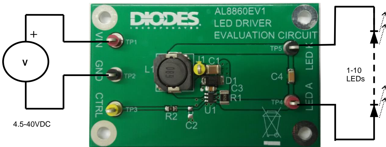
Figure 1: AL8860EV1 evaluation board and connection diagram

Warning: At 40V nominal operation with 680mA output, the LED will be hot and very bright