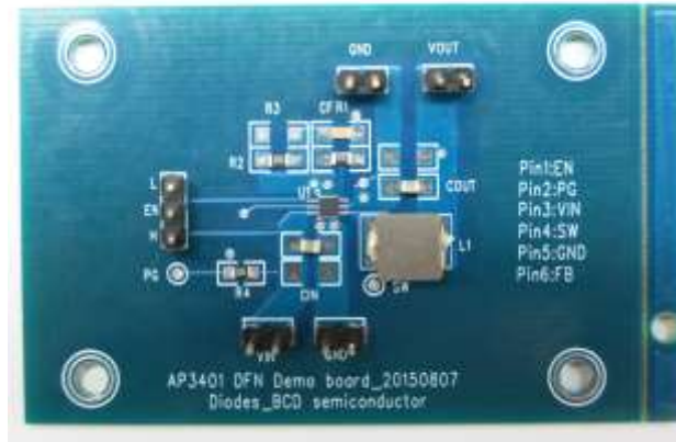
UDFN2020-6 Packages EVB