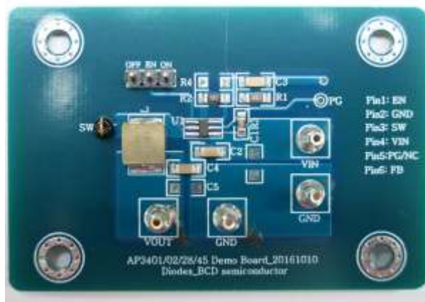
TSOT23-6 Package EVB